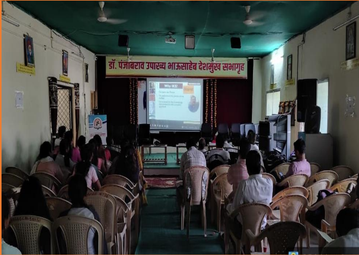
Auditorium Seminar Hall