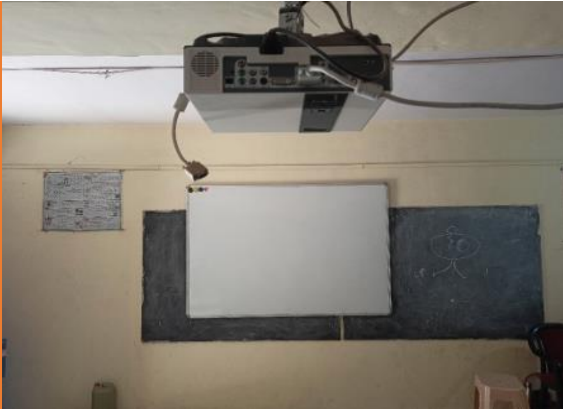
ICT Class Room No. 27