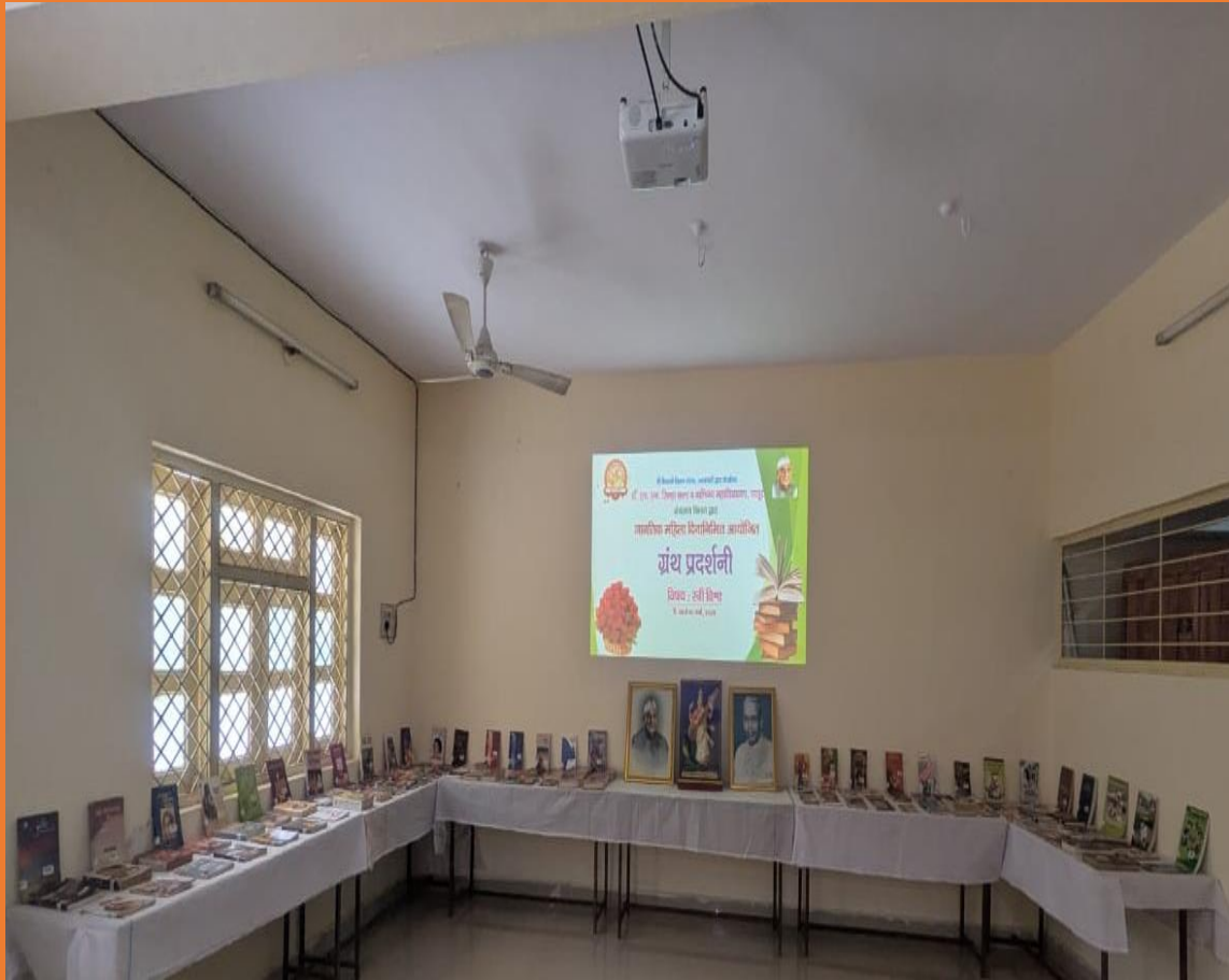
Library Multipurpose Hall