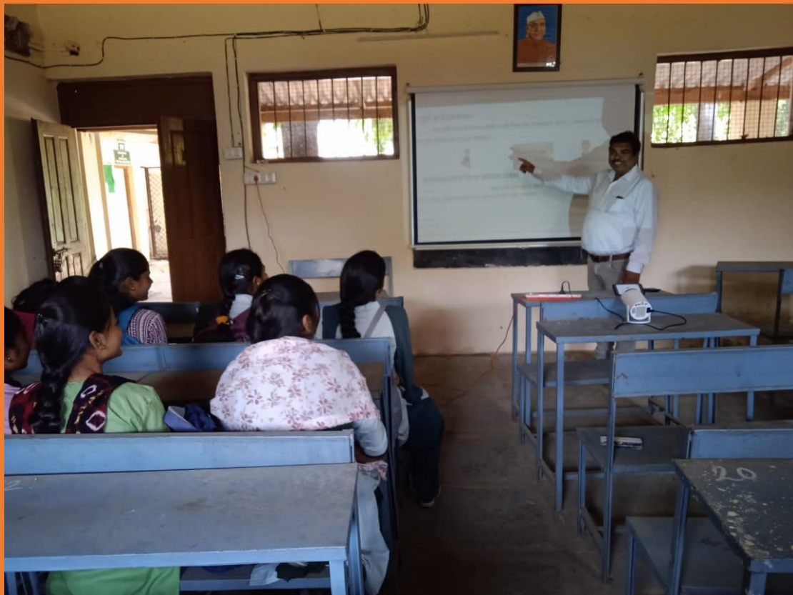
ICT Class Room No. 37