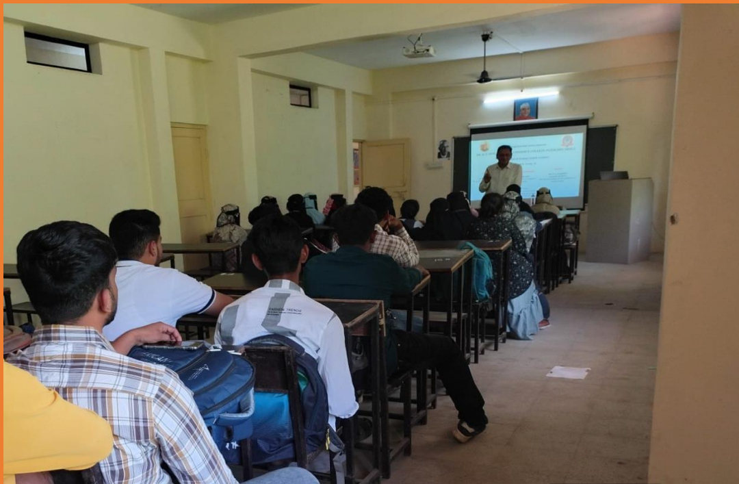
Science Building Seminar Hall