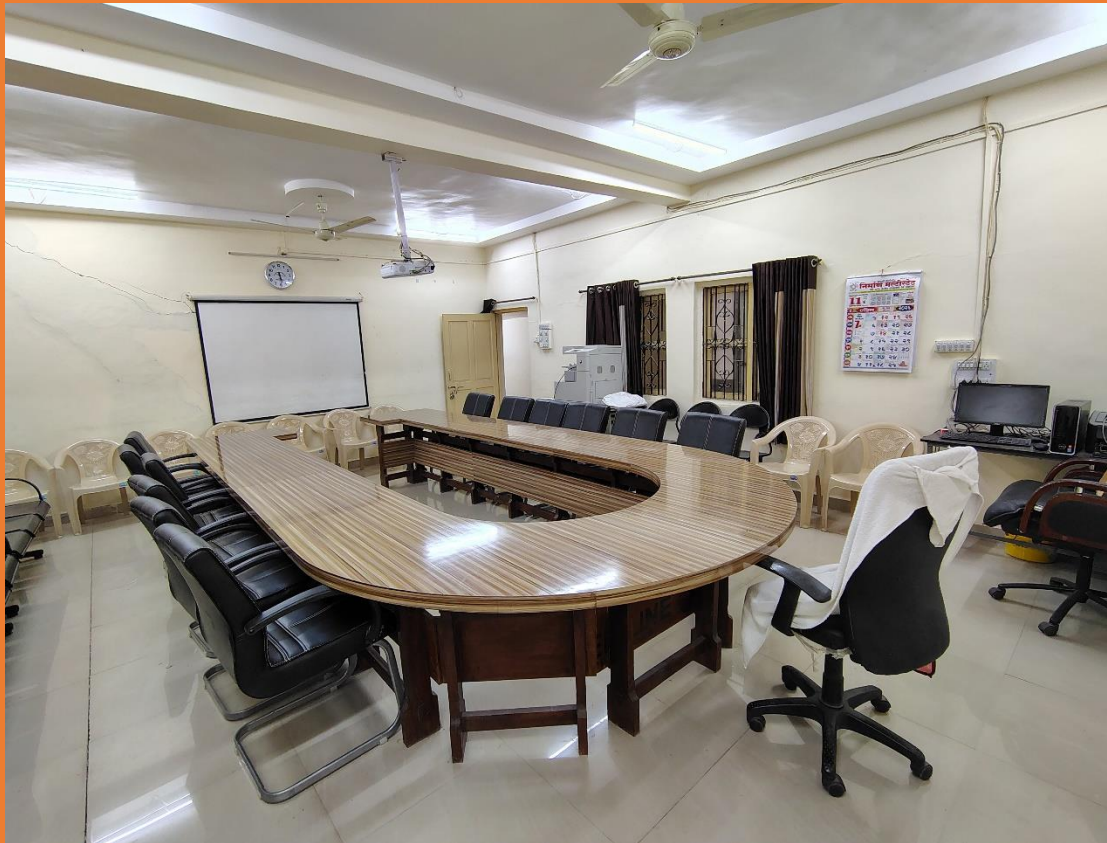
IQAC Meeting Hall