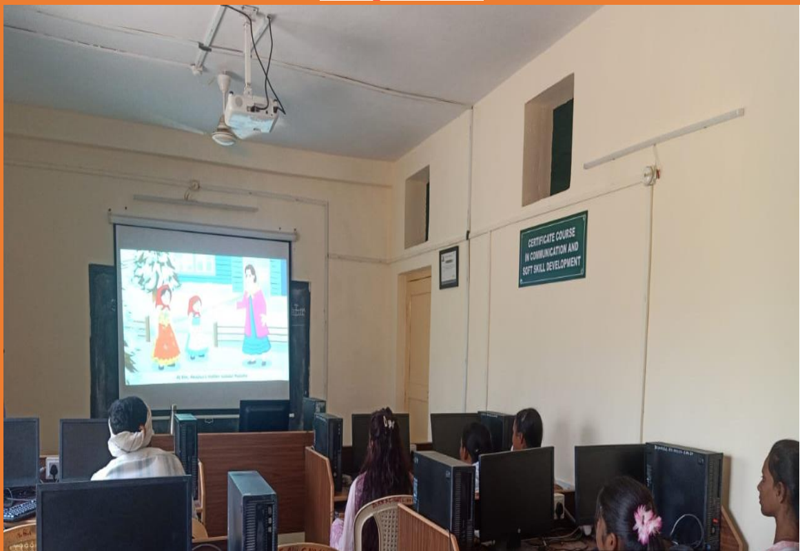
English Language Lab